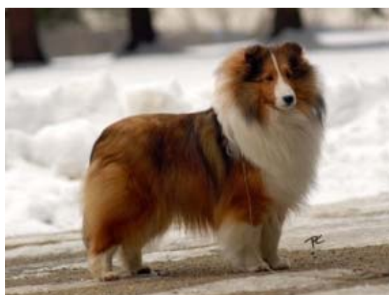
At 7 months before leaving for Finland