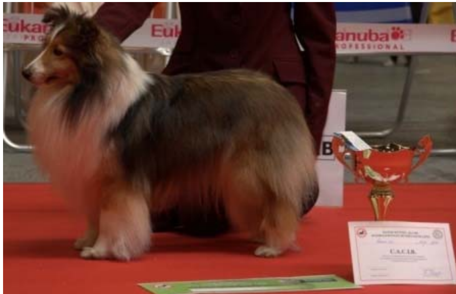
At the World Dog Show in Denmark